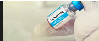
Vaccination for booster shot for Smallpox Monkeypox MPXV. Doctor with vial of roses vaccine for Monkeypox disease

by Brian Alheimer Posted: Jul 21, 2022 / 86:33 PM CDT Updated: Jul 21, 2022 / 07:22 PM CDT